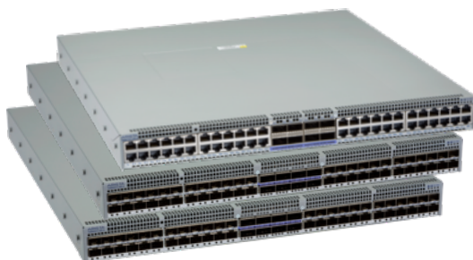
Arista 7050SX3-48C8, 7050SX3-48C8C and 7050TX3-48C8 : 48x 10G SFP or 10GBaseT and 8x 100G QSFP ports

The Arista 7050SX3-48C8 , 7050SX3-48C8C and 7050TX3-48C8 are 1RU systems with 48 port of 10G and 8 ports of 100G with an overall throughput of 2.56 Tbps. The SX3 high density 10G ports can be configured for a mix of 10G/1G speeds to facilitate mixed connections and the TX3 RJ45 ports allows 1G, 2.5G, 5G, and 10G speeds. The QSFP100 ports allow 100GbE or 40GbE as network uplinks, with a rich choice of transceivers and cables for both leaf and spine deployment. With no oversubscription, the switch is optimized for high performance deployments with consistent features.